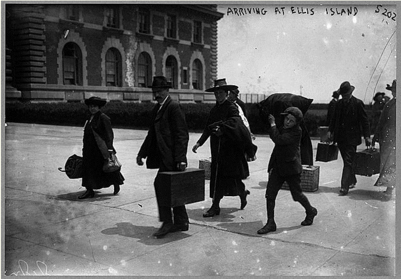
Arriving at Ellis Island, Library of Congress Prints and Photographs Division, 1907