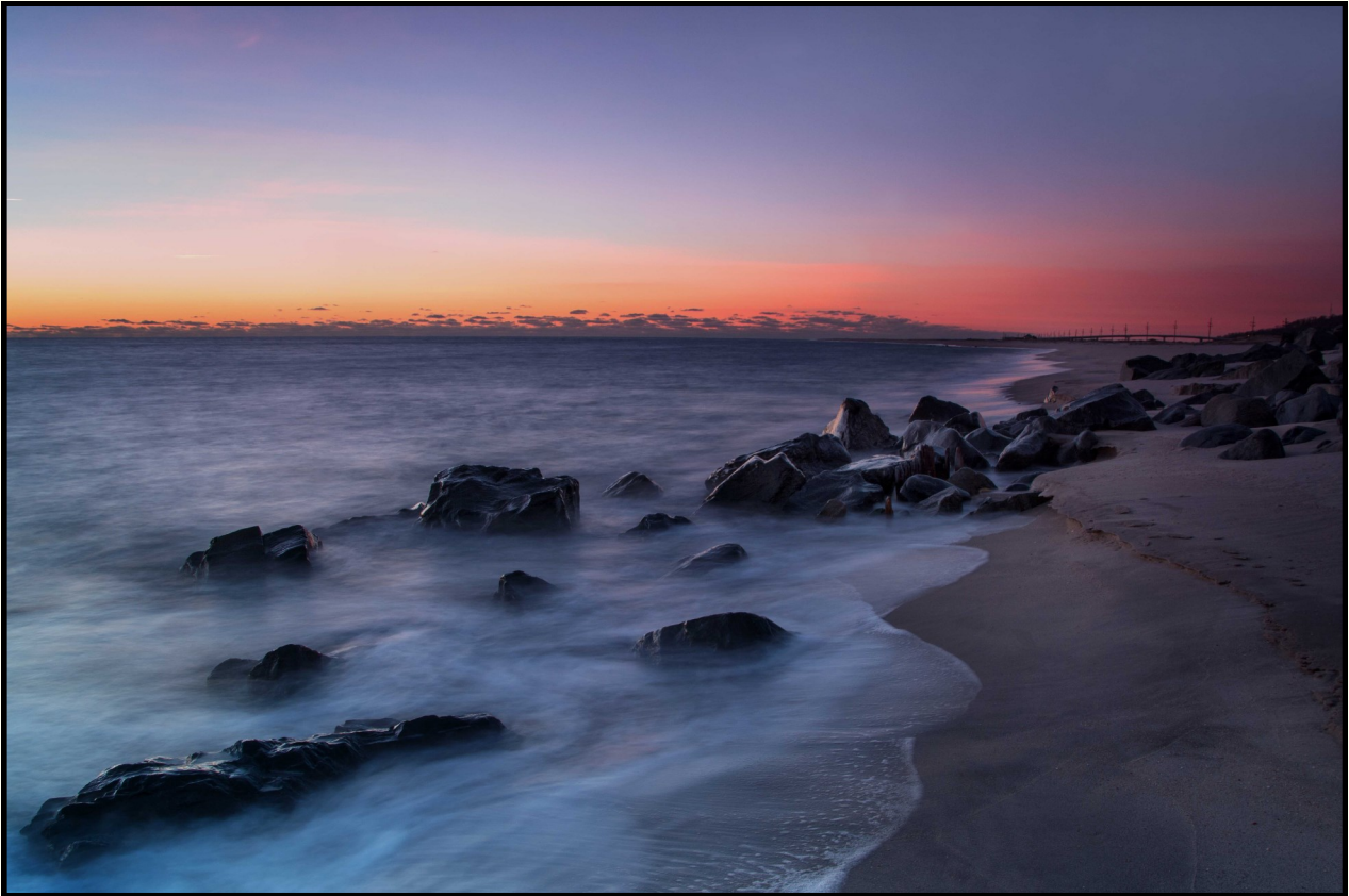
This page: Sandy Hook Sunset